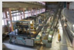
Industrial Curing precision UV curing of contact lenses, inks, paints, resins