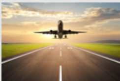
Aircraft interior cabin lighting

Learn more by clicking on the application images below: