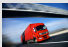
Transportation interior and tail lights