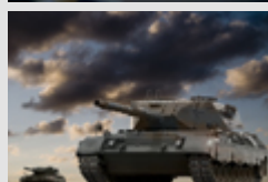
Vetronics backlighting of ground vehicle displays