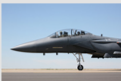
Avionics backlighting of critical flight displays