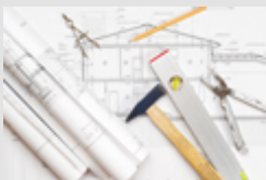
Architectural large scale specialty illumination