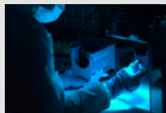
Medical Instruments scanning and illumination lamps