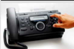
Facsimile Machines aperture lamps