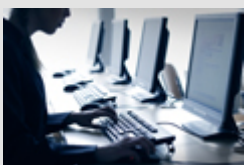
Computers laptop LCD backlighting, replacement lamps and accessories