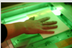
Copiers & Scanners aperture and reflector lamps