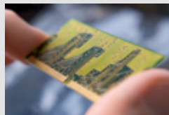
Machine Vision aperture lamps, special phosphors