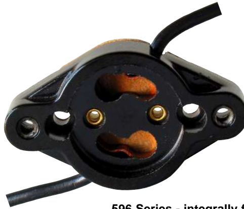
596 Series - integrally formed body of black phenolic mounting flanges.