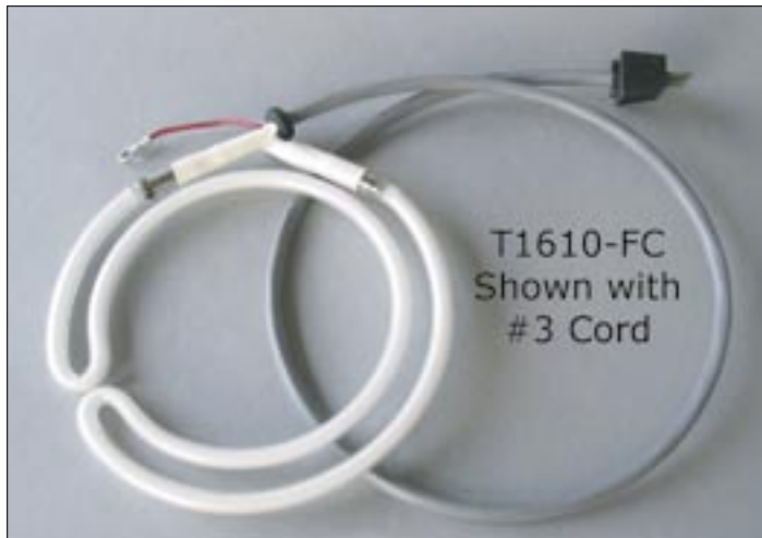
Full Circle Replacement Lamp Head Assembly: Lamp, Power Cord and 3 pin rectangular connector