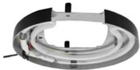
Replacement Lamp Head Assemblies: (Reflector, Lamp, Power Cord and Connector)